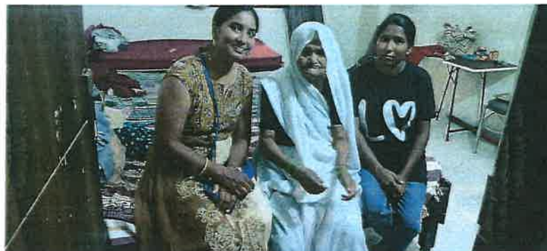
Wisdom words for the youngsters

PRINCIPAL Innovative Institute of Law Plot No.-6 Knowledge Park-2 Greater Noida-201308