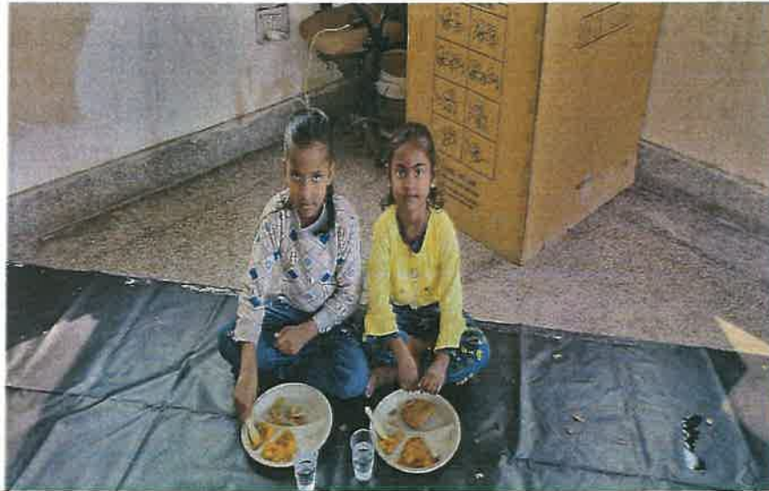
Active Participation of students in the distribution of food plates

Approved by Bar Council of India (BCI), Delhi & Affiliated To CCS University, Meerut, U. P.