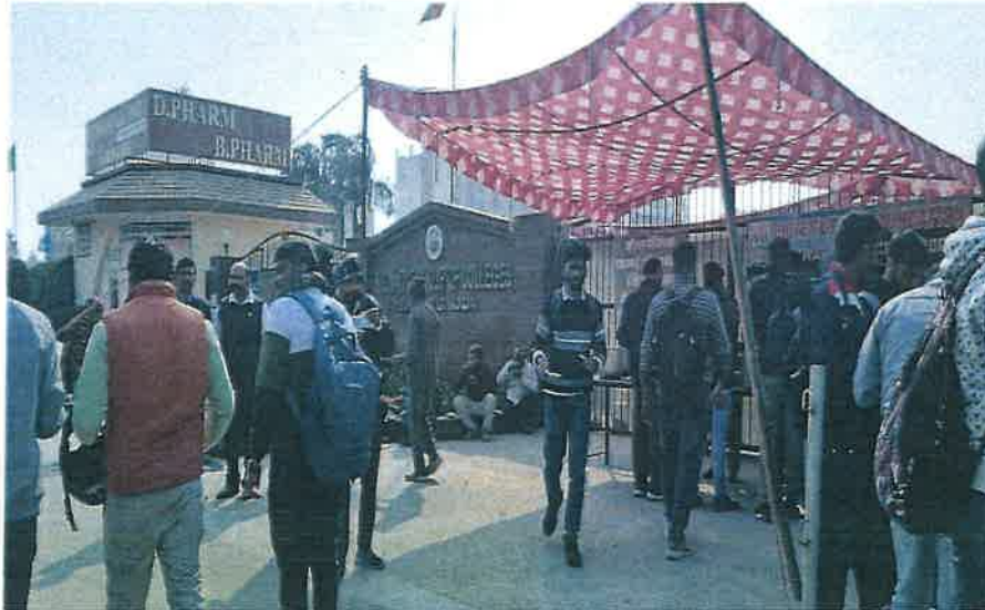
Active Participation of students in the distribution of food plates

Approved by Bar Council of India (BCI), Delhi & Affiliated To CCS University, Meerut, U. P.