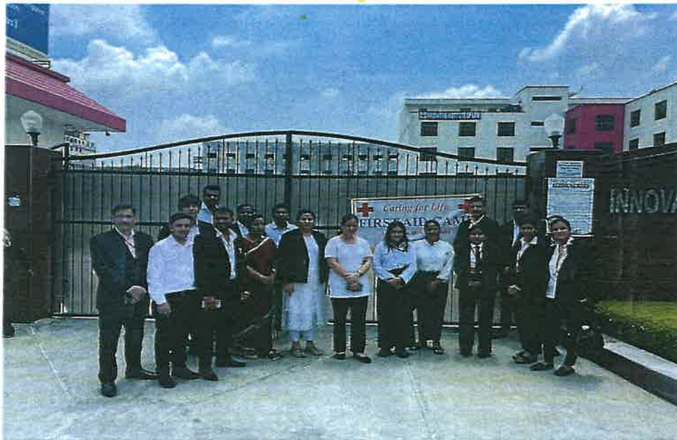
First Aid Camp