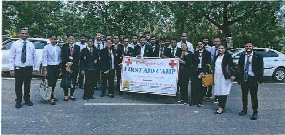
First Aid Camp

Approved by Bar Council of India (BCI), Delhi & Affiliated To CCS University, Meerut, U. P.