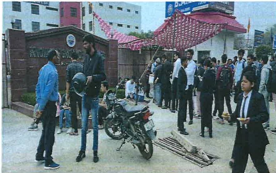
Active Participation of students in the distribution of food plates

PRINCIPAL Innovative Institute of Law Plot No. - 6, Knowledge Park - 2 Greater Noida - 201308