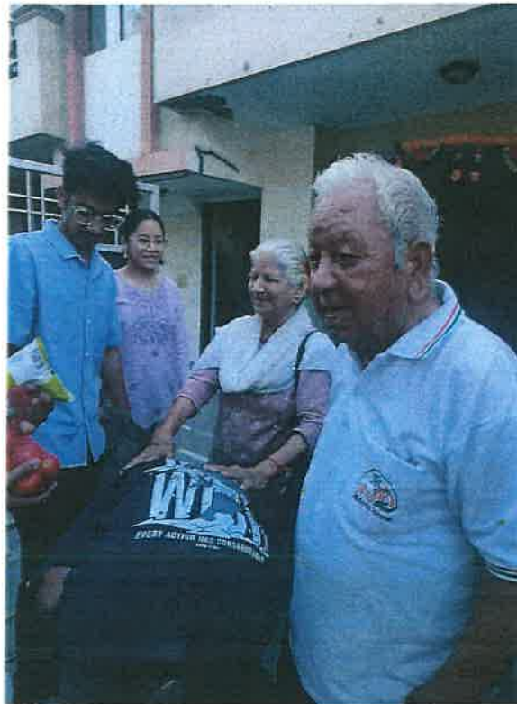
Blessing taken by student of Innovative Institute of Law

Approved by Bar Council of India (BCI), Delhi & Affiliated To CCS University, Meerut, U. P.