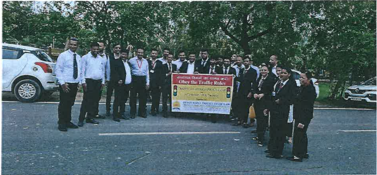
Traffic awareness camp

Approved by Bar Council of India (BCI), Delhi & Affiliated To CCS University, Meerut, U. P.