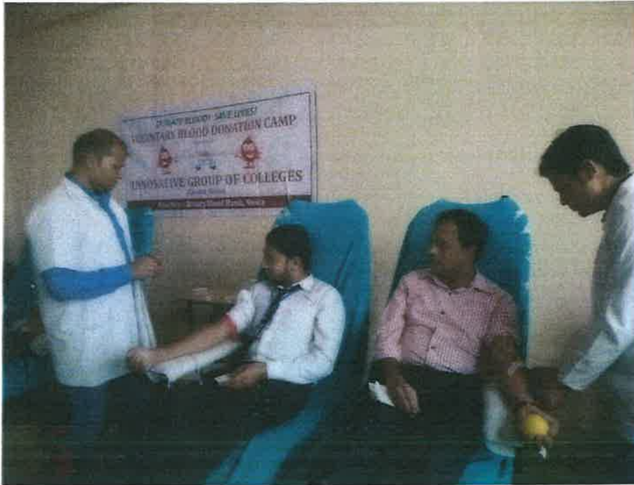
Blood Donation Camp by innovative Institute of Law

Approved by Bar Council of India (BCI), Delhi & Affiliated To CCS University, Meerut, U. P.