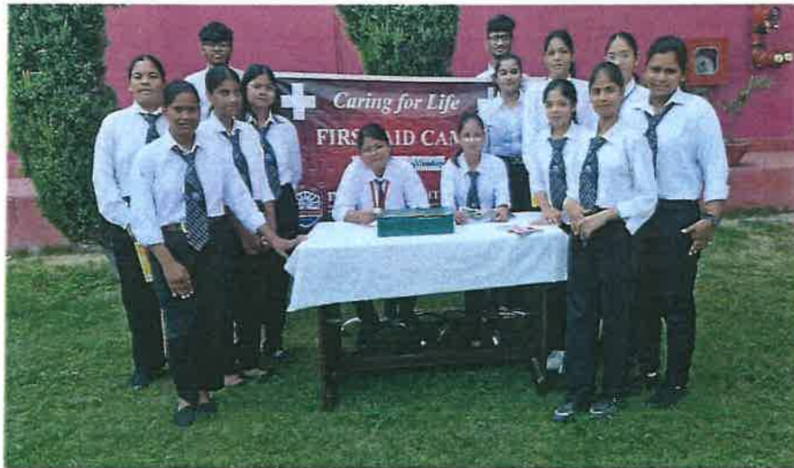
First Aid Camp organized by students of BA.LLB and LLB

Approved by Bar Council of India (BCI), Delhi & Affiliated To CCS University, Meerut, U. P.