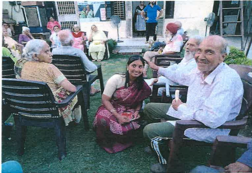
Visit to Old Age Home

Approved by Bar Council of India (BCI), Delhi & Affiliated To CCS University, Meerut, U. P.