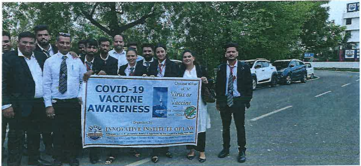
Covid Vaccine Awareness by students of BA.LLB and LLB

Approved by Bar Council of India (BCI), Delhi & Affiliated To CCS University, Meerut, U. P.