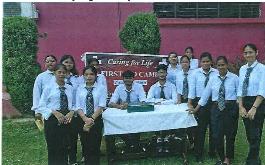
First Aid Camp organized by students of BA.LLB and LLB

PRINCIPAL Innovative Institute of Law Plot No -6 Knowledge Park-2 Greater Noida-201308