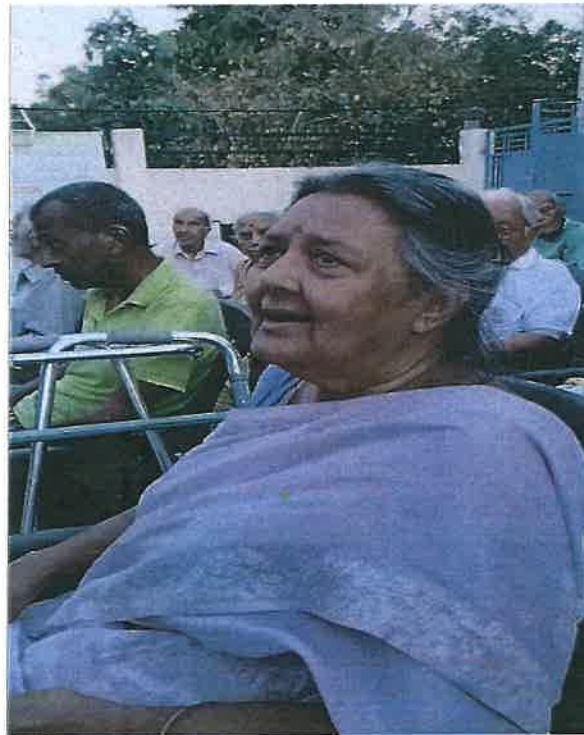
Visit to Old Age Home

Approved by Bar Council of India (BCI), Delhi & Affiliated To CCS University, Meerut, U. P.