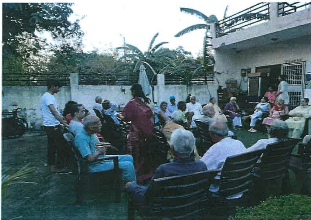
Visit to Old Age Home

PRINCIPAL Innovative Institute of Law Plot No -6 Knowledge Park-2 Greater Noida-201308