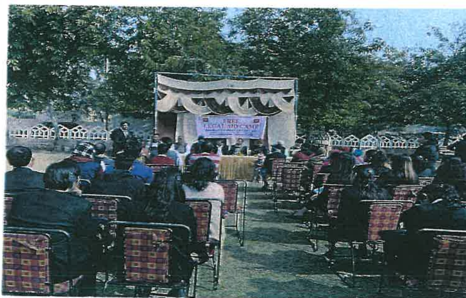
Free Legal aid camp

Approved by Bar Council of India (BCI), Delhi & Affiliated To CCS University, Meerut, U P