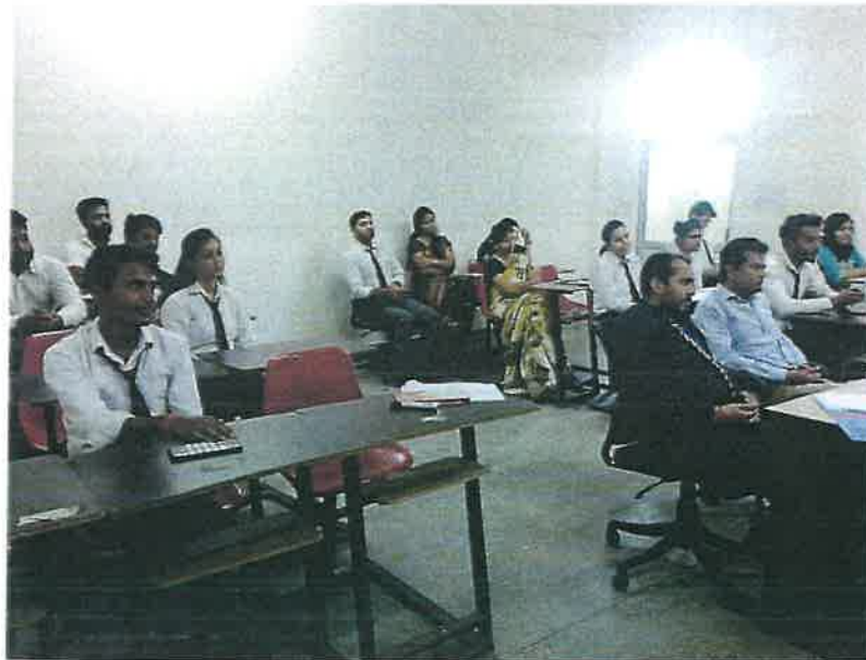
Debate competition on the CAA

Approved by Bar Council of India (BCI), Delhi & Affiliated To CCS University, Meerut, U. P.