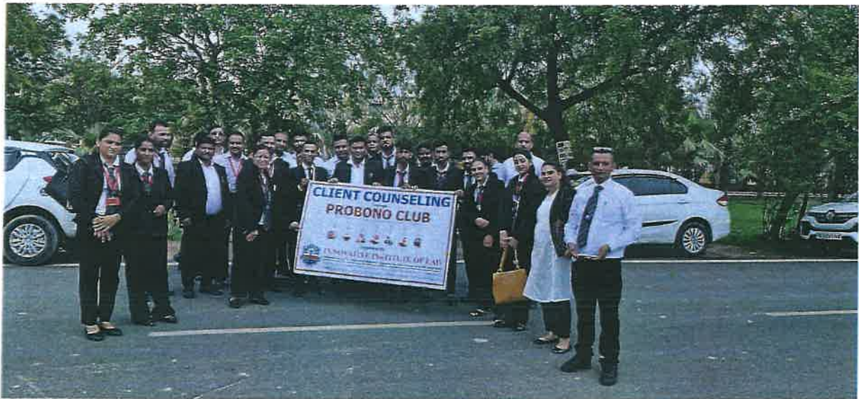
Client counseling organized by students of BALLB and LLB

Approved by Bar Council of India (BCI), Delhi & Affiliated To CCS University, Meerut, U. P.