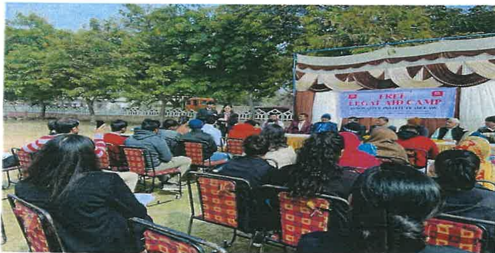
Services given to the people by our legal experts

Plot No. - 6, Knowledge Park - 2, Greater Noida, U. P. - 201308. (Near Knowledge Park - 2 Metro Station) Ph: 0120-2328555 | Website - www.innovativeinstituteoflaw.com | E-mail: innovativelaw2005@gmail.com