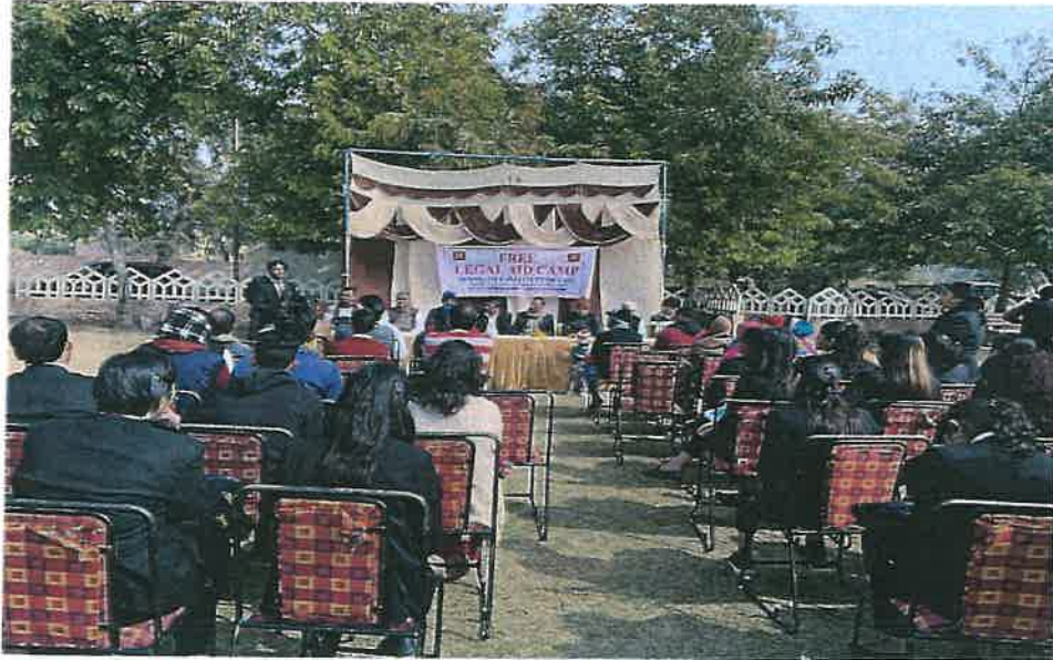
Free Legal aid camp

Approved by Bar Council of India (BCI), Delhi & Affiliated To CCS University, Meerut, U. P.