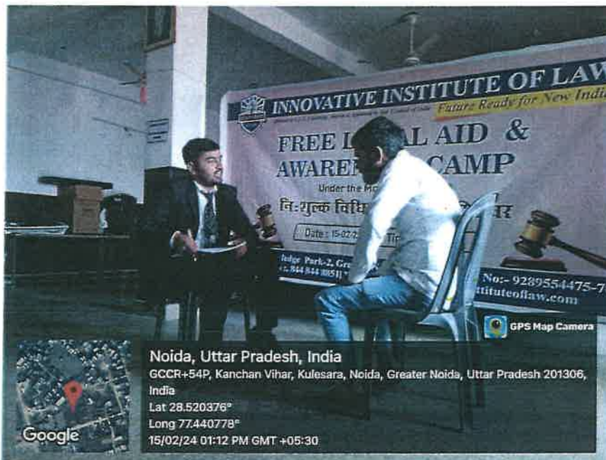
Legal aid camp

Approved by Bar Council of India (BCI), Delhi & Affiliated To CCS University, Meerut, U. P