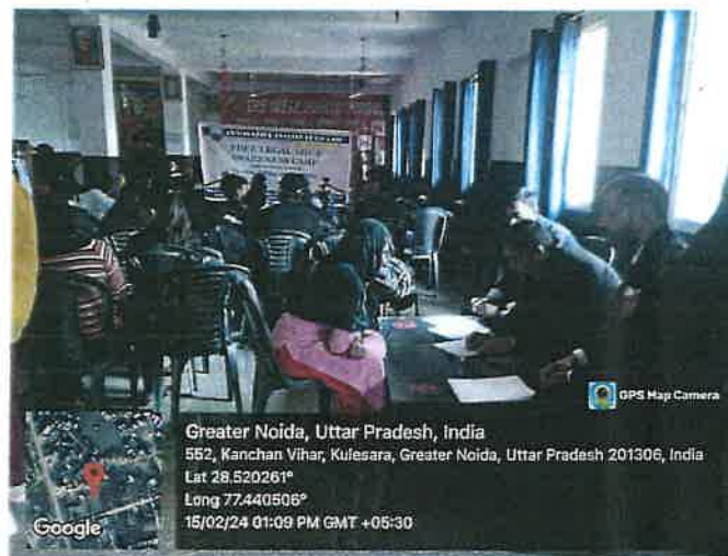
Legal aid camp

Plot No. - 6, Knowledge Park - 2, Greater Noida, U. P. - 201308. (Near Knowledge Park - 2 Metro Station) Ph: 0120-2328555 | Website - www.innovativeinstituteoflaw.com | E-mail: innovativelaw2005@gmail.com