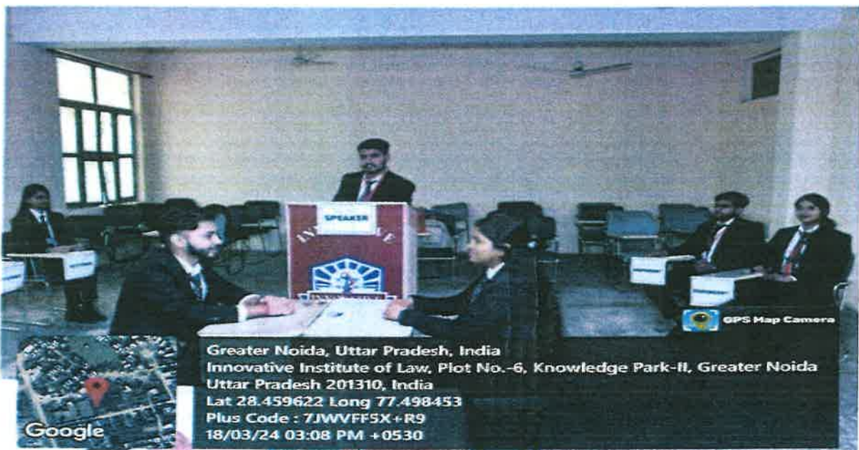
Intra Moot Court Competition