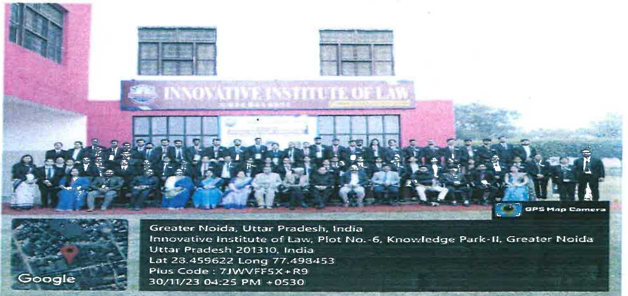
National Moot Court

Approved by Bar Council of India (BCI), Delhi & Affiliated To CCS University, Meerut, U P