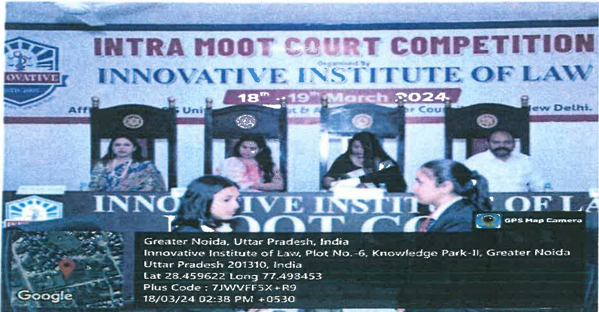
Intra Moot Court Competition

Approved by Bar Council of India (BCI), Delhi & Affiliated To CCS University, Meerut, U.P.