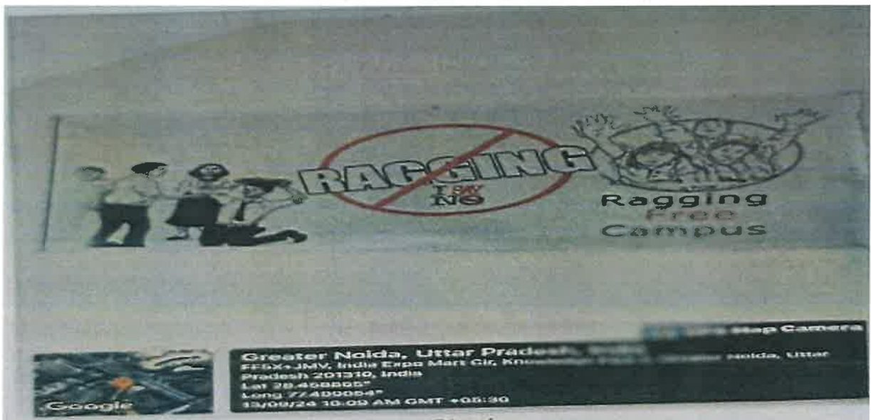
ANTI RAGGING PHOTO

Plot No. - 6, Knowledge Park - 2, Greater Noida, U. P. - 201308. (Near Knowledge Park - 2 Metro Station)