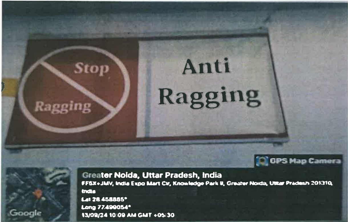
ANTI RAGGING PHOTO

Approved by Bar Council of India (BCI), Delhi & Affiliated To CCS University, Meerut, U. P.