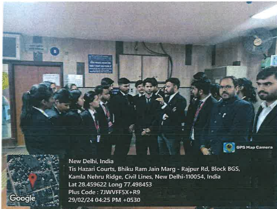
Tis Hazari Court Visit by Students of LLB and BALLB

Approved by Bar Council of India (BCI), Delhi & Affiliated To CCS University, Meerut, U. P.