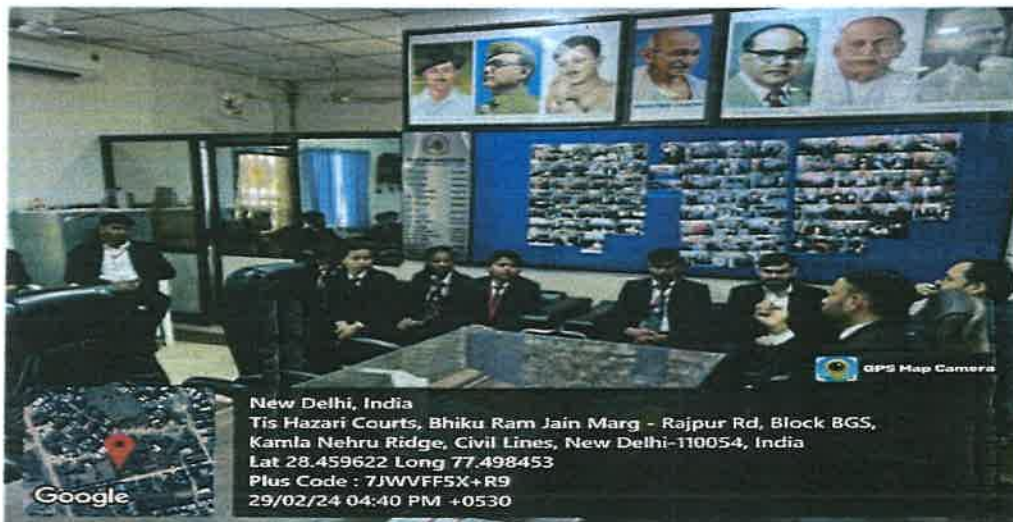
Tis Hazari Court Visit by Students of LLB and BALLB

PRINCIPAL Innovative Institute of Law Plot No. - 6, Knowledge Park - 2, Greater Noida, U. P. - 201308. (Near Knowledge Park - 2 Metro Station) Ph: 0120-2328555 | Website - www.innovativeinstituteoflaw.com | E-mail: innovativelaw2005@gmail.com