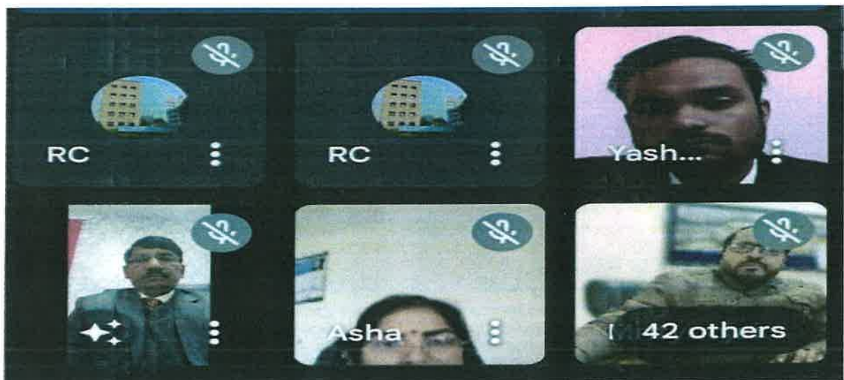
Students enthusiastically participated in the webinar

PRINCIPAL Innovative Institute of Law Plot No. - 6, Knowledge Park - 2, Greater Noida, U. P. - 201308. (Near Knowledge Park - 2 Metro Station) Ph: 0120-2328555 | Website - www.innovativeinstituteoflaw.com | E-mail: innovativelaw2005@gmail.com