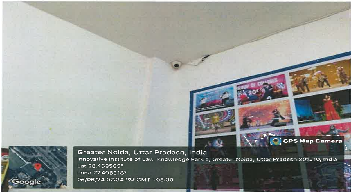
CCTV CAMERA'S SURVEILLANCE IN FREE LEGAL AID CELL

Approved by Bar Council of India (BCI), Delhi & Affiliated To CCS University, Meerut, U. P.