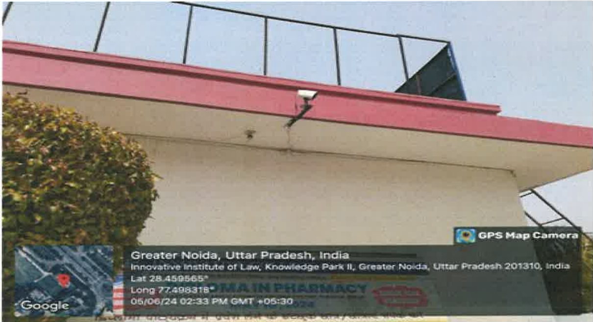
Cctv Camera's Surveillance Towards Green Field of Innovative Institute of Law

Approved by Bar Council of India (BCI), Delhi & Affiliated To CCS University, Meerut, U. P.